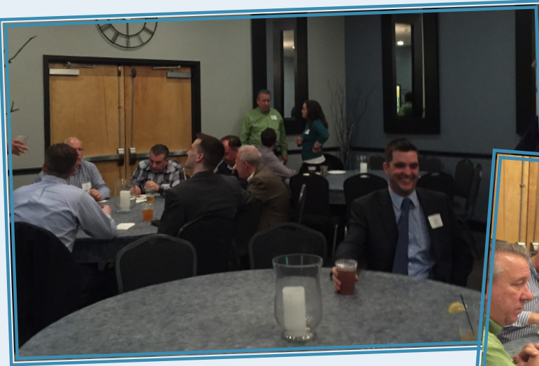
Everyone enjoyed the company and the wings at The Grill at the Dome!