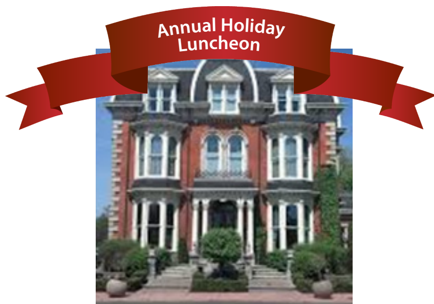
December 5, 2014 The Mansion on Delaware

YES, Sea bass is on the menu! We know this is a favorite for most of you.