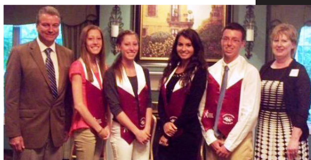
West Seneca West winners