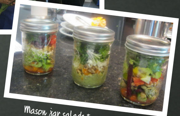
Mason jar salads to go...delicious!